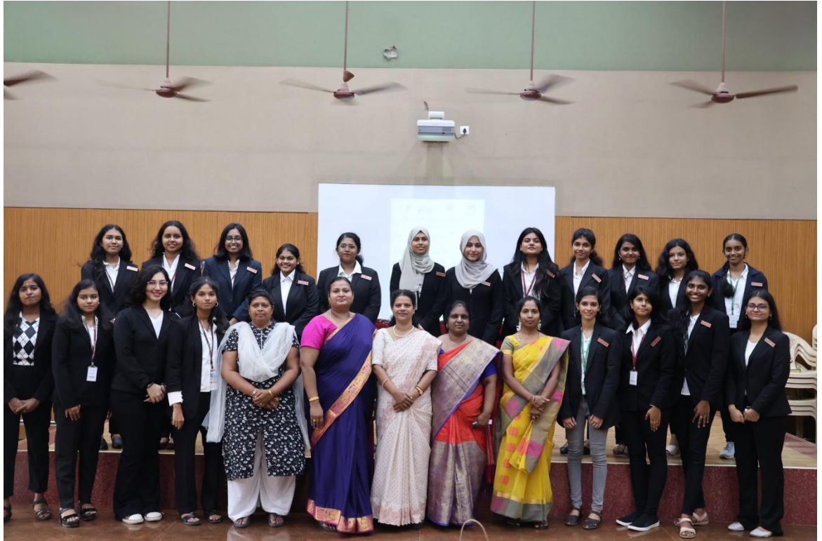
IIC Faculty members & Student Office Bearers 6.0