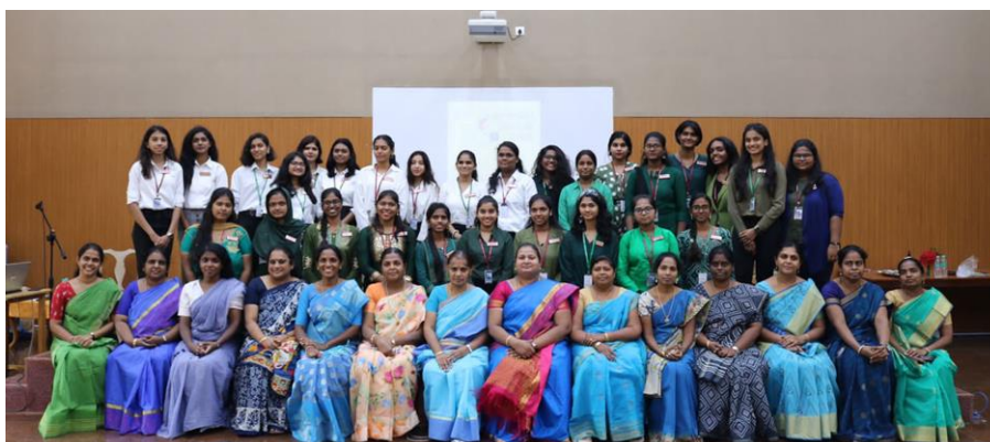
IIC Faculty members & Student Office Bearers 5.0