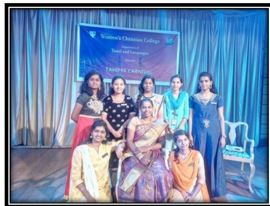
Winners of the group dance