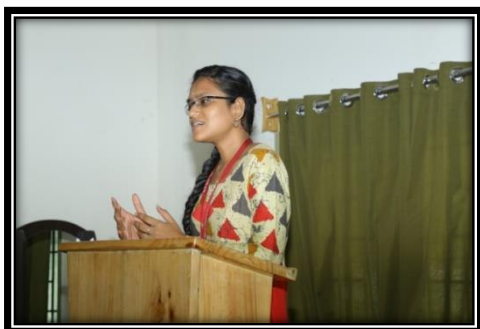
Story telling competition