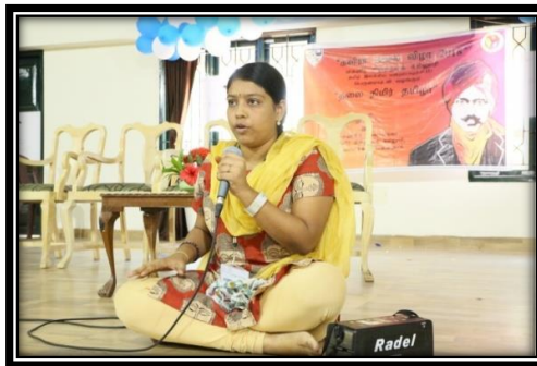
Solo singing competiton