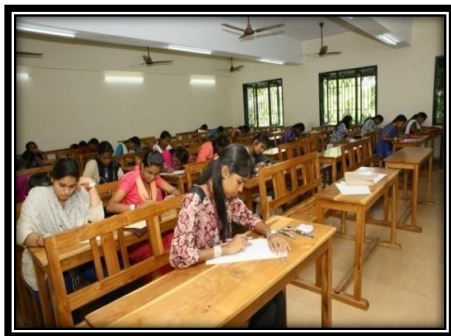
Essay and poem writing