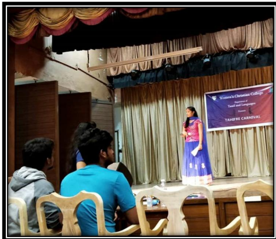
Judging of solo dance event