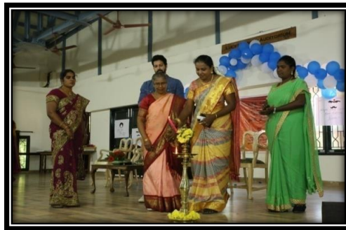
Lighting of lamps