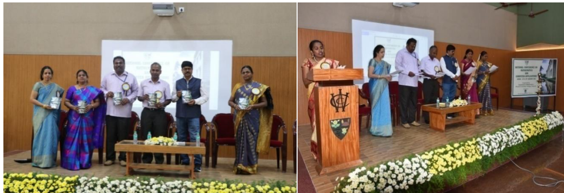
Release of Book of Abstracts with ISBN during the Inaugural Ceremony