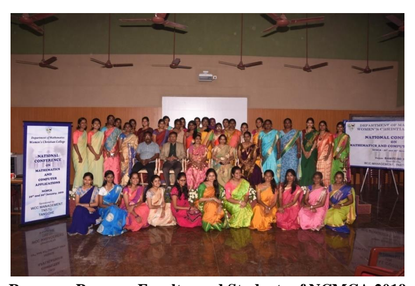
Resource Persons, Faculty, and Students of NCMCA 2019