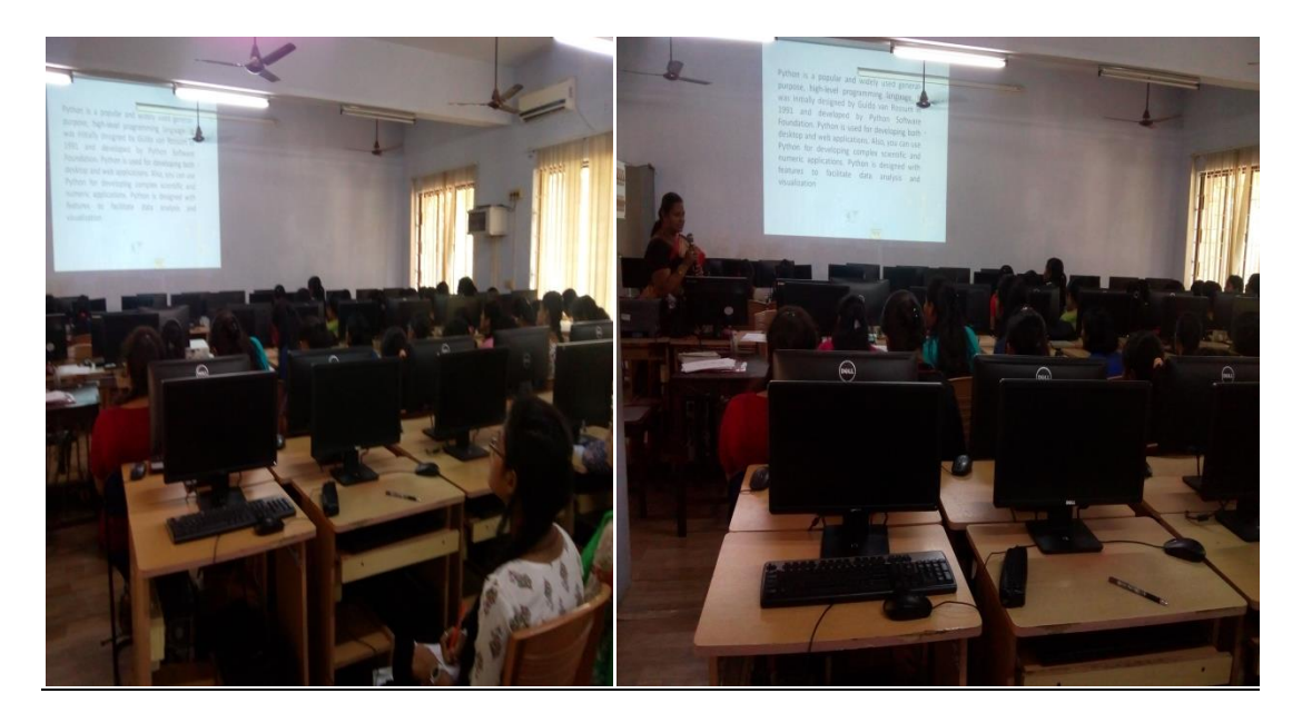
Lecture and Lab session class during Certificate course

A Certificate Course on "Python Programming" was conducted during the academic year 2018-2019 in the even semester. The course was taken for 10 days as 2 hours per day and planned for 20 hours which includes 10 hours theory and 10 hours for practical session. Each day one hour theory is taken which is followed by practical session. Students from II and III year from various departments including B.COM (CA), Computer Science and Technology (CST), Information Technology (IT) and from BCA (Computer Applications) had registered for this course. A total 75 students participated in this course and collected fee of Rs.250 per student. The classes are conducted in BCA lab of RMS block. All the staff members of BCA department taught the course. A Pre-planned schedule with various topics is assigned to each staff. For practical session, two staff members were allotted to guide the students. The course was successfully completed by conducting a test for students to evaluate the performance and knowledge gained by this certificate course.