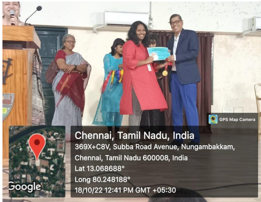
PRIZE DISTRIBUTION DURING THE ASSEMBLY PROGRAM ON SUBSTANCE ABUSE AND DIGITAL ADDICTION HELD ON 18 TH OCTOBER 2022