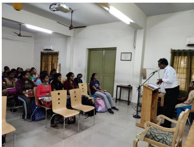
Students enthralled with stories of the 1940s Stars and Superstars