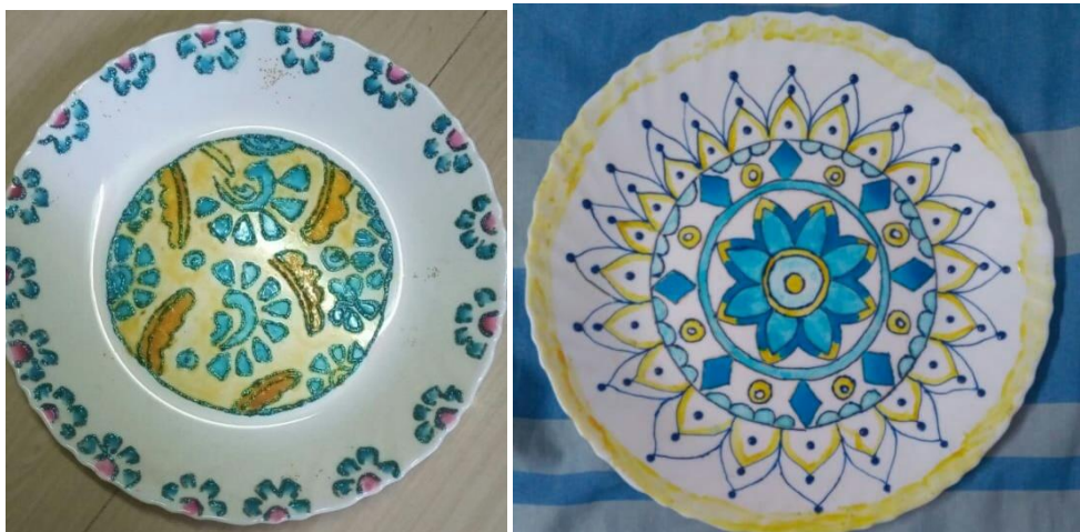
Some of the ceramic painted plates done by students