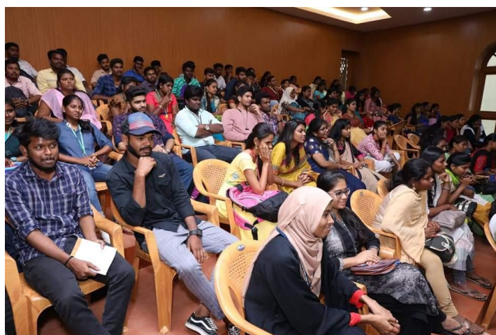
Students from other Colleges The Opening Plenary

Apart from the students of History Department and Department of International Relations of our College, the Workshop drew great participation from other Colleges in the city, namely Meenakshi College for Women, Stella Maris College, DG Vaishnav College, New College and Loyola College.