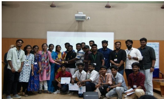
Loyola college students with the trophy