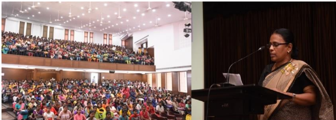
Information Resource Centre(IRC) Orientation programme for Newly admitted students (22.06.2019)

1. Information Resource Centre (IRC) organized Orientation programme for newly admitted students on 22.06.2019 for all First-year students. The new students were oriented with an objective to create Awareness College's Library membership, services, and facilities and promote utilization of library resources effectively.